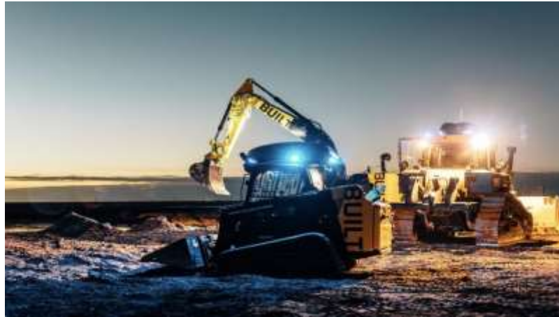
Figure 2: Earth work equipment