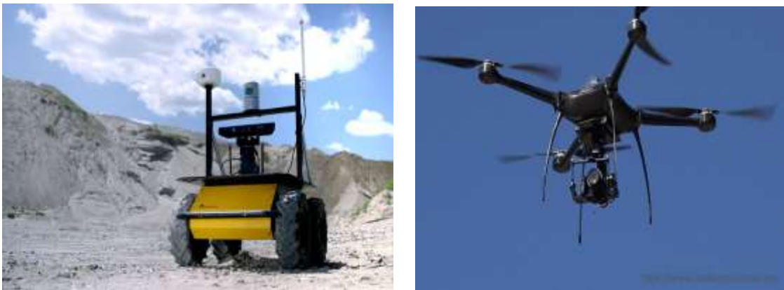
Figure 1: Terrestrial and Aerial devices

Robotic devices, both terrestrial and aerial, are being developed to perform tasks ranging from monitoring and measuring to surveying and inspection in less time and with a greater amount of data than traditional methods (Fig.1). The application of these systems brings improvements to the overall productivity of construction projects because the 3D information extracted from the multi-sensor robots can be incorporated into BIM technology and used in different design phases.