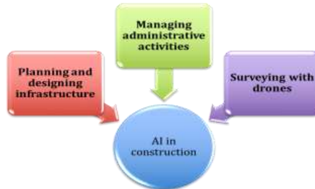
Figure 3: AI in construction