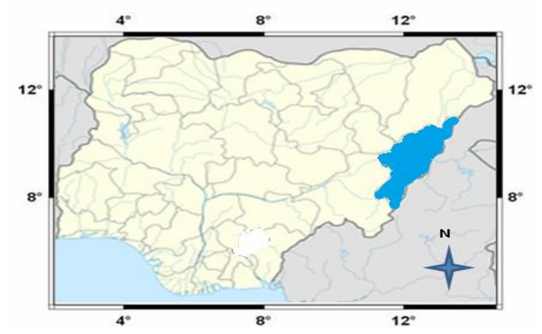
Figure I: Map of Nigeria Showing Adamawa State

(Mohammed, 1999). It shares an international boundary with <u>the Republic of Cameroon</u> to the East and interstate boundaries with <u>Borno</u> to the North, <u>Gombe</u> to the North-West and <u>Taraba</u> to the South-West (Adebayo, 1999; ASMLS, 2010), as shown in Figure I.