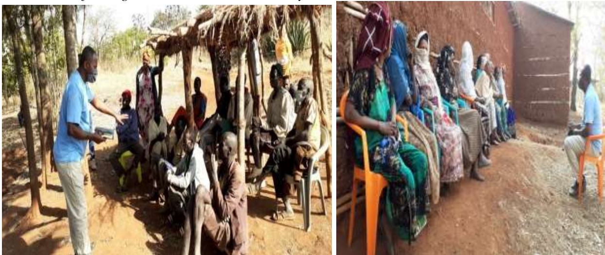
Pictures of women and men Focus Group Discussions in Sonka kebele, 2021