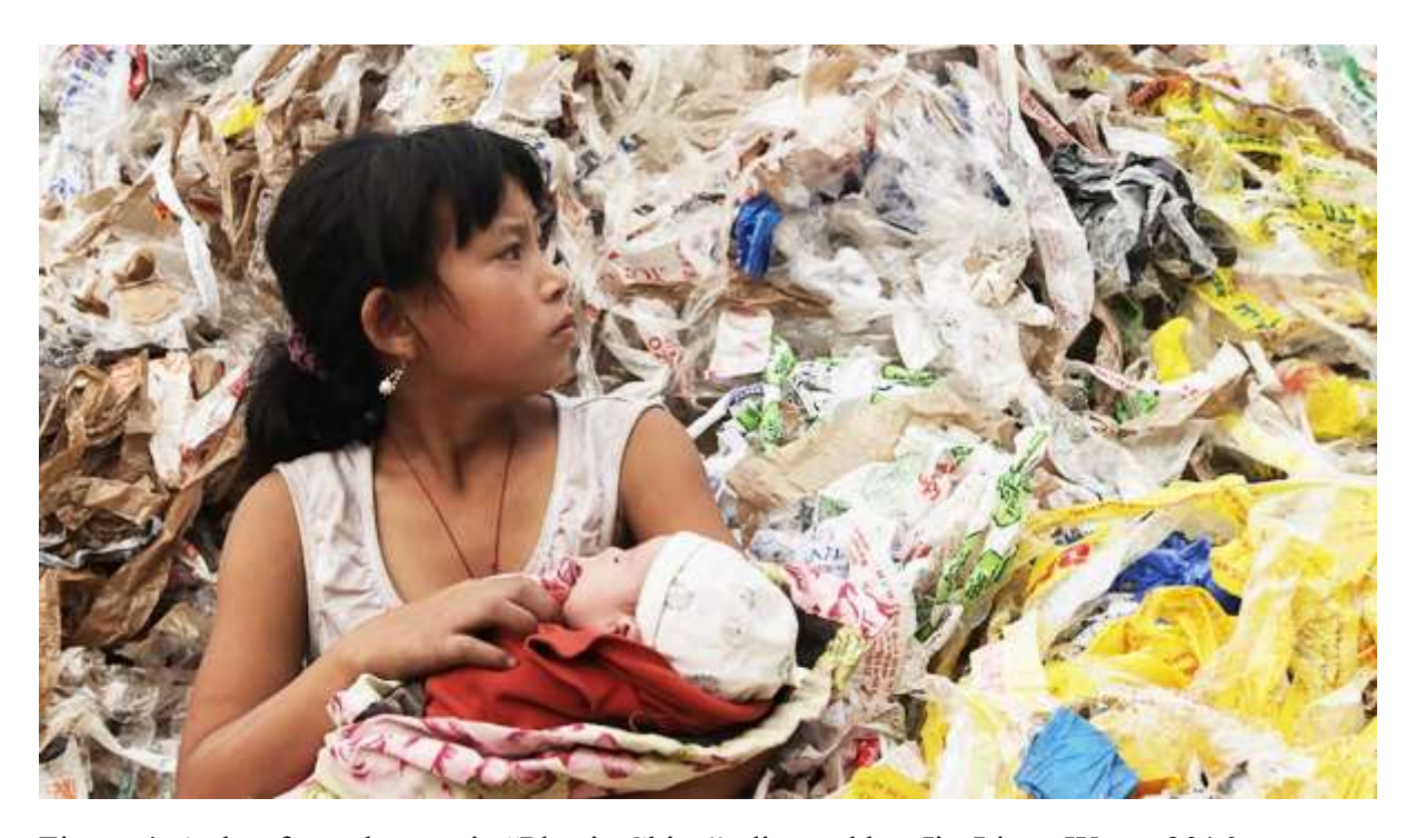
Figure 4: A shot from the movie "Plastic China", directed by: Jiu-Liang Wang, 2016

Publication of the European Centre for Research Training and Development -UK