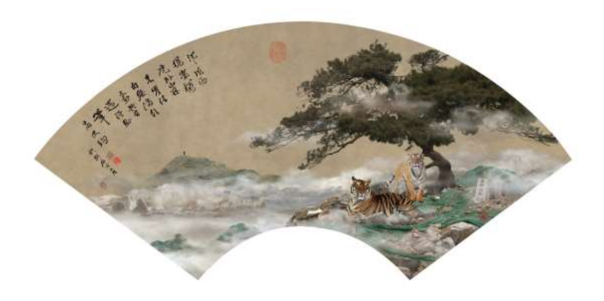
Figure 3: The Roaring Tigers in the Mist (云隐长啸), 2010, Chromogenic Print

Publication of the European Centre for Research Training and Development -UK two tigers enjoying their nap in the misty dense undergrowth deep in the mountains. Reflecting on the classic Shan Shui painting, this ideally calm and almost meditative image invokes peaceful thoughts. Other such things—hints of man's hand and complex industrial patterns—do create a rather disturbing sort of a development that lurks over untouched blossoms. Incorporating all these features, Yao is able to present narratives that deal with ideas of cultural and environmental conservation, the relationship of nature and industry as seen in the urban context of the region, while bringing to the mind of the viewers images related to the concept of nature in the modern context. In order to integrate this photomontage into a text, I adjusted the photomontage's position and orientation to horizontal that the viewers have a crystal-clear view of the details of the artwork.