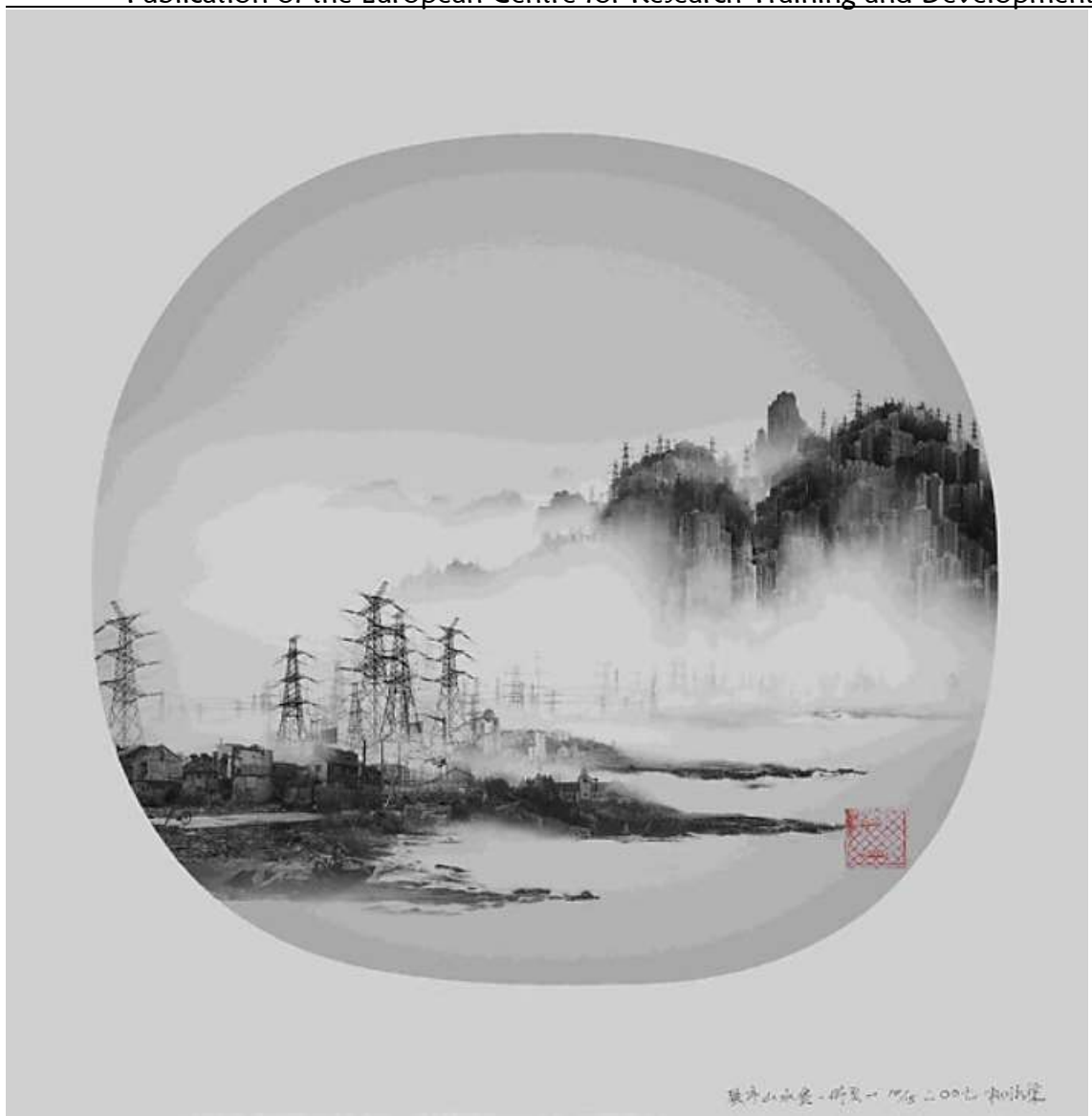
Figure 2: Phantom Landscapes III, Yang Yongliang, 2007, inkjet print on paper, Image: 17 11/16 x 17 11/16 in. (45 x 45 cm), Overall: 26 15/16 x 20 in. (68.5 x 50.8 cm)

Publication of the European Centre for Research Training and Development -UK