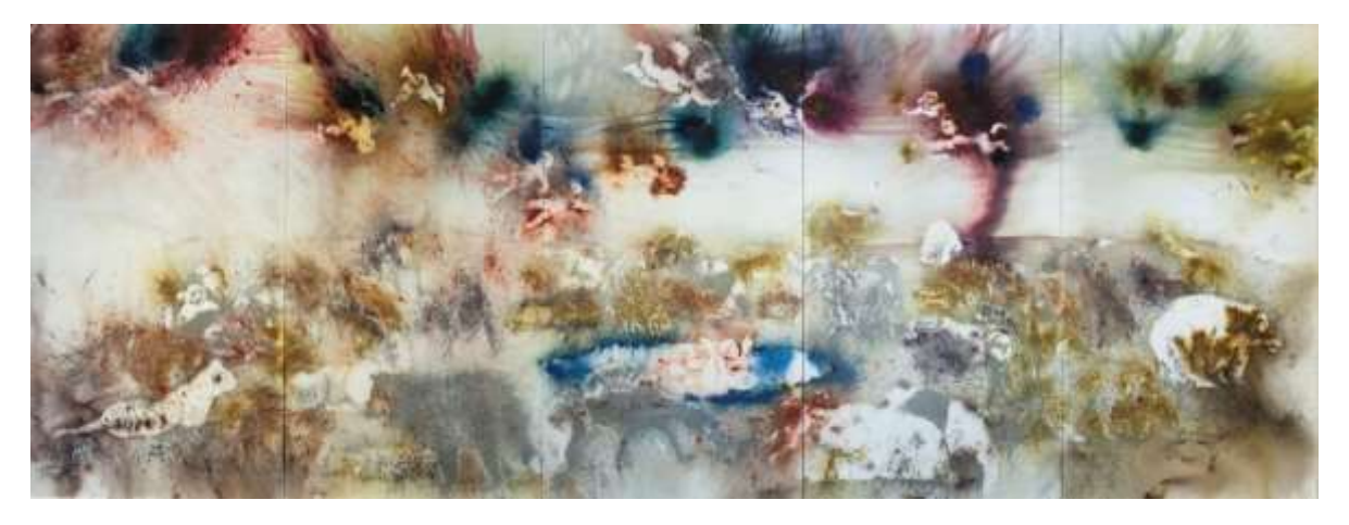
Figure 1: Last Carnival (detail), Cai Guo-Qiang (b. 1957), 2017, Gunpowder on canvas, 280 x 750 cm, The Akatsu Collection, Tokyo

Another of Yang Yongliang's most representative creations, now part of the Phantom Landscape series (Figure 2), best illustrates this tendency. Yang's works visually transport viewers to the modern and busy world whilst of building a picture such as classical Shan Shui paintings. Initially, the work appears to be a serene and beautiful mountain range whose individual elements are structures relating to industrialization. At its most basic, it is a criticism for rapid movement towards urban landscapes. The work integrates industrialization and westernization to critique and preserve such cultures. This contemporary concern permeates through the work showing effective blending of genres while paying respect to tradition.