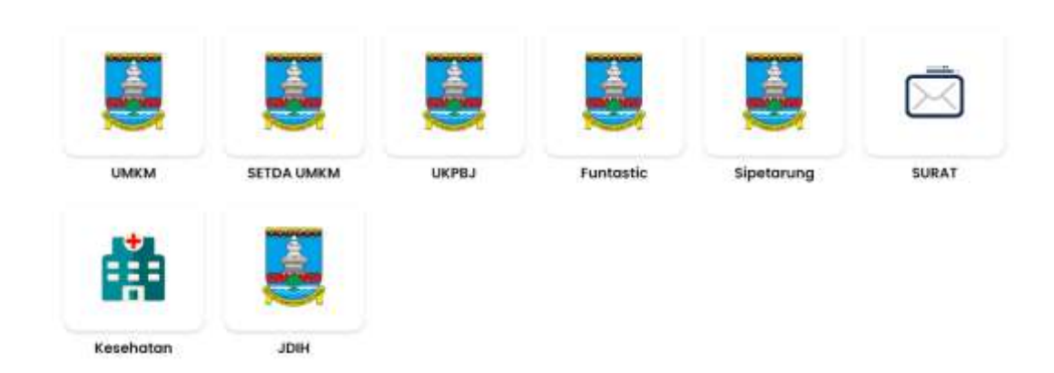
Figure 3. Development of an Electronic-Based Government System for the Government of Serang Regency

improvements and improvements. So that all applications that have been built can be utilized, the final target is to enter stage 4 (utilization).