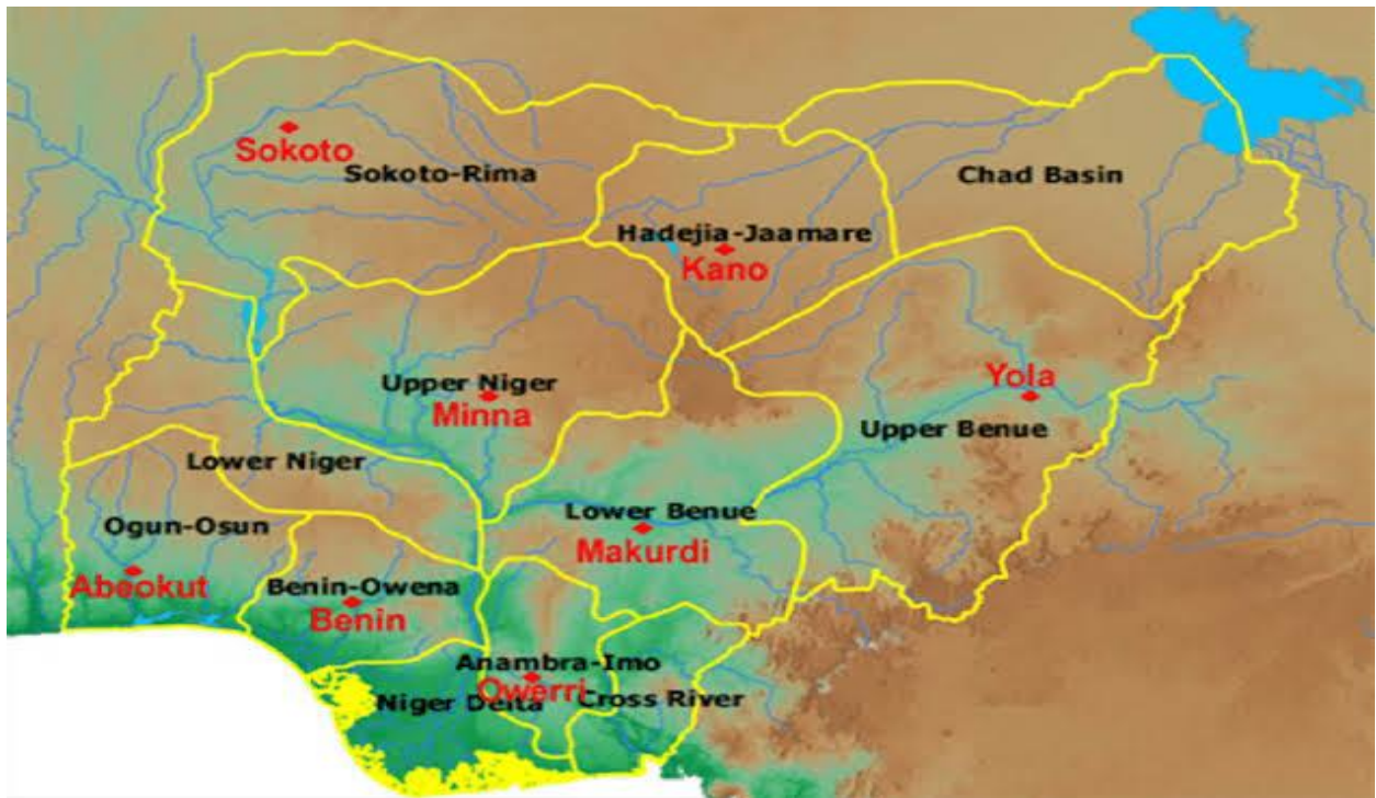
Fig.1 River Basin Development Authorities in Nigeria