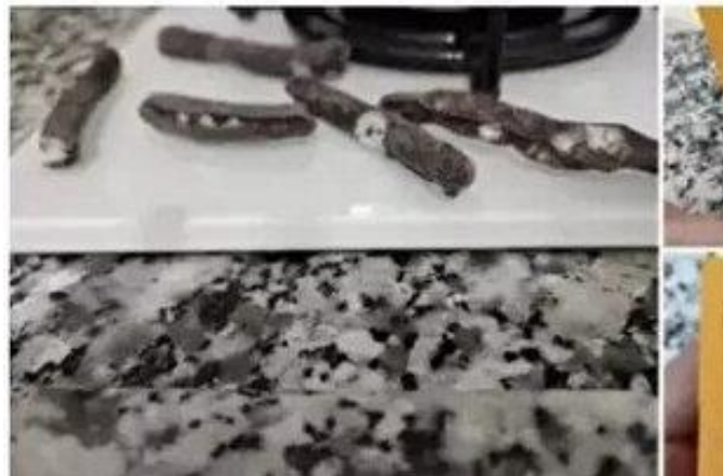
Figure 1. Customer complaint posted On LinkedIn about the poor condition of chocolates purchased within their expiration date, highlighting potential issues in the supply chain process.

Migros Supply Chain Solutions #patiswiss Elif Aslı Yıldız Tunaoğlu