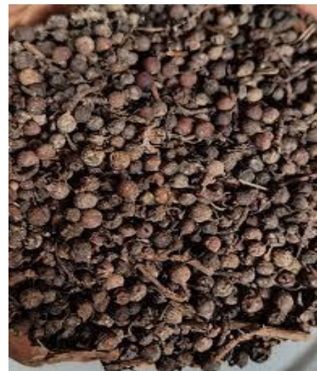
Piper guineense seeds