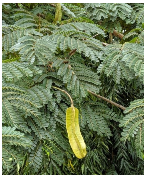
Unripe Tetrapleura Tetraptera Fruit On the Tree

Tetrapleura tetraptera (Ohio-Ohio) respectively. The sixth plot was the Control which was the untreated plot.