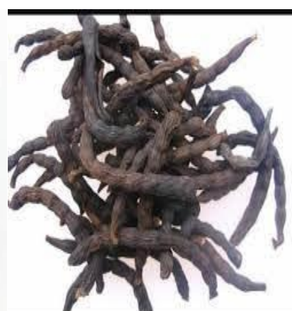
Xylopi aethiopica fruits