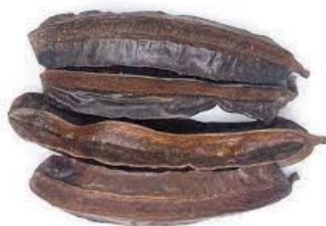
Dry, Ripe and Matured T. tetraptera fruit