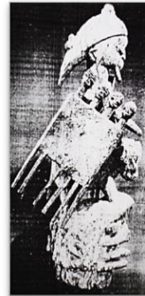
Plate 2c, Source: Drewal, et. al. (1989).