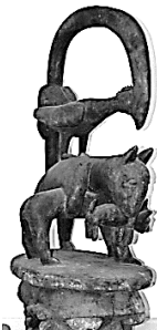
Plate 4c, Mask with dog and prey ( www.apulsafricanart.com ).