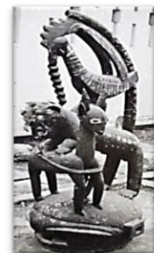
Plate 4d, Source: Abejide (1984)

Plates 4 a-c: Epa headrests showing animals in action (hunting), Plate 4d: Epa with cock and antelope