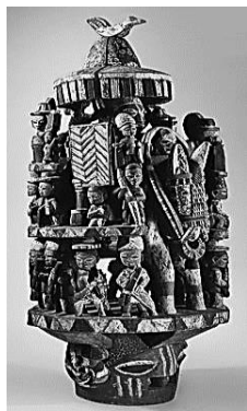
Plate 1a, Source: Cleveland museum of African Art

Epa depicting kings, leaders or holders of authority ( epa alase ): Some celebrated men in Epa masks are powerful kings whose reigns were peaceful. An example is Baba Osi (founding father of Osi) and Epa Orangun . Orangun are names given to a group of Epa masks characterized by many figures arranged in tiers on a platform. This type can be found in Igogo, Ishan, and Erinmope-Ekiti. Masks celebrating rulers are usually depicted as equestrian figures either holding the reign of their horses and horse whisks or staffs of office ( opa ase ). They are typically surrounded by a group of subjects, such as flutists, dundun drummers, and female dancers. The drummers and flutists symbolize people who chant the praises of the kings and announce their presence in real life. Correspondingly, the women dancers both entertain and chant the king's praises. The drummers and flutists thus emulate the importance of musicians in Yoruba culture, which is entertainment and communication, just as the palace musicians chant the praises of kings in real life, entertaining them and communicating the arrival of visitors, among other happenings in the palace. The hand fan held 1b is to honour the main figure. There are however some headrests with the main figures accompanied by soldiers with dane guns ( ibon ). Also, typical to this group of Epa mask is the covering of their heads with umbrella. 1c however, showcases another type of crown that resembles the beaded crown of resent kings.