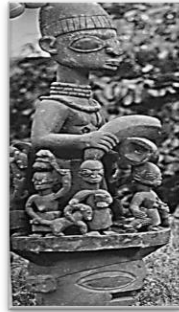
Plate 3: Epa Celebrating Farmers, Picton (1994).

Epa oloko masks depicting animals: There are numerous oloko masks with animals as the sole figures on Epa masks' superstructures. Some of the animals depicted on these masks are in the hunting group, while others are sacrificial animals.