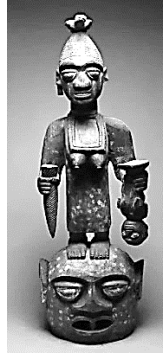
Plate 6b