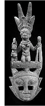
Plate 6c

Plate 6a-c: Epa representing women leaders