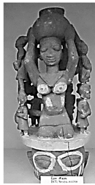
Plate 10, Epa Headrest depicting sacrifice bearer, Source: Institute of African Studies, O.A.U., Ile-Ife

(1968:21) documents a similar image in the palace of Owa of Odo-Ayedun Ekiti, depicting a naked woman with a container on her head representing one of the wives of Owa. It is affirmed that the carrier, in this case, is usually the youngest queen, who used to carry Owa's offering of kola nuts to the shrine of Orisa-nla in closed calabash. The carved image is held to be used now rather than disrobing queens in the modern era. The nudity of the image, however, signifies purity and perfection.