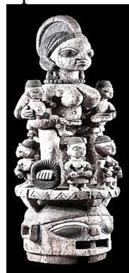
Plate 8b

Plates 8a and b: Variations of mother of their twins