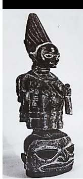
Plate 6a, Source: Drewal, et. al. (1989)