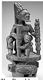
Plate 2b: Brooklyn Museum.