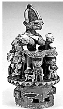
Plate 8a

Epa Masquerades Celebrating Mothers of Twins (Eye eji or Iya ibeji): Among the Ekiti-Yoruba, twins ( ibeji ), are regarded as special children and are the pride of all mothers because, apart from the luck of having two babies at once, their births are believed to bring good fortune to their parents and the family at large, which is the basis for the excerpt ‘ ode le alakisa, so le alakisa di ti olugba aso : (meaning: one who visits the paupers enrich them, transforming them to owners of multiple clothes). There are copious representations of the twins’ mothers, depicted kneeling, standing, or sitting. Their commonest depiction of women is as full-breasted women with erect breasts and pointed nipples, holding their twins to their sides in a typical way of showing off children (Plates 8a and b). Each of the twins in plate 8b is holding their mother's breasts with one hand and a bowl in another. The bowls they hold are reminiscent of the alms and offerings people give to the twins because they believe in their capability of enabling the gift of children like themselves. At the base are figures standing and kneeling, as well as women presenting offerings to the gods and making supplications to the gods to enable procreation or fertility.