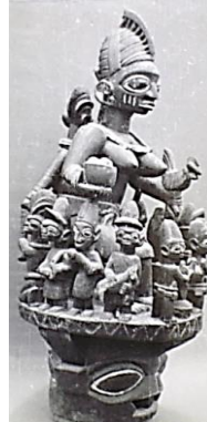
Plate 7, Celebration of fertile woman, Source: Abejide (1984)

Epa Masquerades Celebrating Mothers of Twins (Eye eji or Iya ibeji): Among the Ekiti-Yoruba, twins ( ibeji ), are regarded as special children and are the pride of all mothers because, apart from the luck of having two babies at once, their births are believed to bring good fortune to their parents and the family at large, which is the basis for the excerpt ‘ ode le alakisa, so le alakisa di ti olugba aso : (meaning: one who visits the paupers enrich them, transforming them to owners of multiple clothes). There are copious representations of the twins’ mothers, depicted kneeling, standing, or sitting. Their commonest depiction of women is as full-breasted women with erect breasts and pointed nipples, holding their twins to their sides in a typical way of showing off children (Plates 8a and b). Each of the twins in plate 8b is holding their mother's breasts with one hand and a bowl in another. The bowls they hold are reminiscent of the alms and offerings people give to the twins because they believe in their capability of enabling the gift of children like themselves. At the base are figures standing and kneeling, as well as women presenting offerings to the gods and making supplications to the gods to enable procreation or fertility.