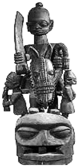
Plate 2a, Source: Cleveland museum of African Art.

jubilating women (who may be queens or enslaved people/palace attendants), representing the people who usher in victorious warriors on such occasions. Their entourage are most times accompanied by women pounding with mortar and pestle, signifying the preparation of pounded yam ( iyan ), which is the staple food of the Ekiti people and the usual food for celebrating victorious and joyous occasions.