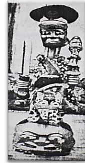
Plate 2d, Source: Abejide (1984).

Plates 2 a-d: Variations of masks celebrating warriors