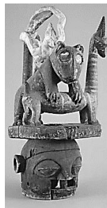
Plate 4b: