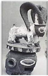
Plate 5a, Ram

Oloko masks portraying sacrificial animals: Some Epa masks depict sacrificial animals in their superstructures; such images include ram ( agbo , plate 5a), Epa with dog ( aja , plate 5b), hare ( ehoro , Plate 5c), pangolin or ant eater ( akika ,). All the representations of sacrificial animals signify homage to the gods. Plate 5d, however, portrays a tortoise ( ijapa or olobaun ) in three tiers. The usage of tortoise is probably due to its association with wisdom and cunningness in Ekiti mythological and oral literature.