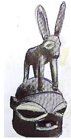
Plate 5c, Hare