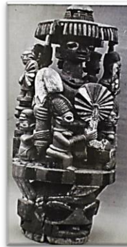
Plate 1b