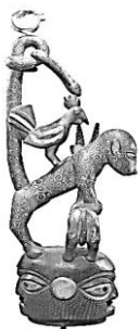
Plate 4a, Source: Preston (1991).

Oloko masks portraying hunting animals: There are several images of Epa , including the image of leopards ( Ekun ) or lions ( kiniun ) capturing their prey (Plates 4a and b). These animals are esteemed because of their associated symbolic importance, leading to the allegorical association of people and human aspirations with the characteristics of these animals. Consequently, people often commonly symbolically refer to themselves as progenies, leopards, or lions, meaning they are 'descendants of the valiant and people. This is because the animals are associated with greatness and gallantry. The leopard is known to be agile, swift, courageous, and ferocious. Their portrayer, according to Shelton 1997:124, signifies warfare; likewise, Fagg et al. ( ibid , 95), on the other hand, enlightens that Oloko capturing animals is metaphorical of their founder / chief warrior defeating enemies at the war front. Plate 4c, conversely, showcases a dog with a hen on his back and its puppy standing beside it, clutching a kid with its mouth, while plate 4d depicts Epa with the representation of cock ( akuko ) mounting an antelope ( igala ); this is however merely a social commentary, as chicken cannot hunt an antelope.