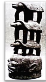
Plate 5d, Tortoise, Source: Abejide (1984)

Plates 5a- d Portrayers sacrificial Animals