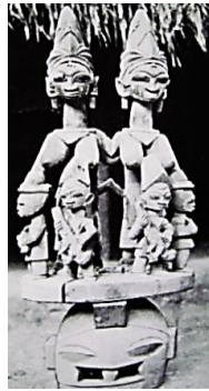
Plate 9, Mask depicting twins, Source: Bascom (1973).

Epa showcasing twins (eji / omo meji or ibeji): Just like the mothers of their twins, ( ibeji ) themselves are believed to be special children, and deities themselves are honored to ensure their benevolence. The form on the mask in plate 9 differs from other portrayals, as it depicts a set of standing matured twins with full pointed breasts, beautified with earrings, bracelets, waist beads, and special elaborate coiffures. They are surrounded by standing and kneeling figures either praying or paying homage. It also displays the belief that twins are special children who are gods themselves, who can influence children's giving to the barren.