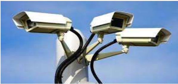
Figure 7: AI Camera (Tribune Online, n.d.).