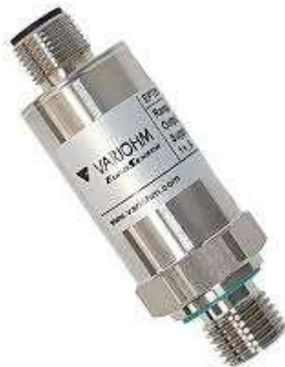
Figure 5: Pressure Sensor