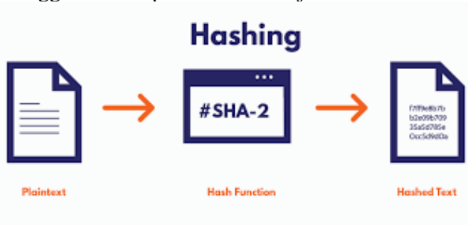
Figure 9: cryptographic hash functions (Manyorock, 2023)

The system will employ end-to-end encryption (E2EE) to protect data transmitted between IoT sensors, cameras, and the backend AI system. This will ensure that Data collected by IoT devices (e.g., motion sensors, pressure sensors, NFC readers, and AI cameras) is encrypted at the source. Also, during transmission, data will be secured with TLS (Transport Layer Security) protocols to protect it from interception or unauthorised access. On the receiving end (backend AI system), the data will be decrypted only after reaching its intended destination, ensuring it remains protected during the transmission process. Further, the system will incorporate cryptographic hash functions to ensure the integrity of transmitted data. The backend system recalculates the hash upon receipt to verify that the data has not been altered or tampered with during transmission. If discrepancies are detected, the data is flagged as compromised and rejected.