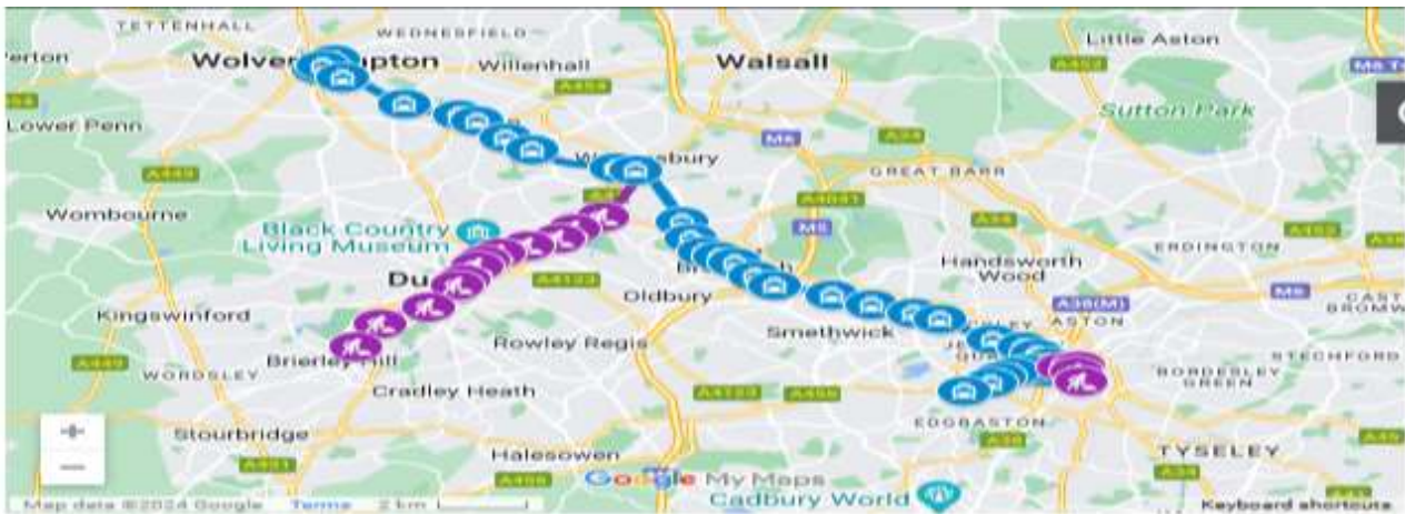
Figure 8: Map Showing West Midlands Metro Proposed Expansion (Google Maps)

Problem: According to reports, Hucknall and Bulwell tram operators posted a £57m loss last year in 2023 due to fare evasion. This shows that the tram network faces significant fare evasion, especially during peak hours, mainly because of the open boarding system it uses. Passengers often bypass ticket validation, contributing to revenue losses. However, the manual inspection system is limited to local inspectors who check and issue fines. Due to high passenger volumes, many evaders go unchecked. The present system is ineffective during rush hour and time-consuming.