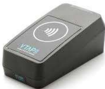
Figure 6: NFC-enabled cards