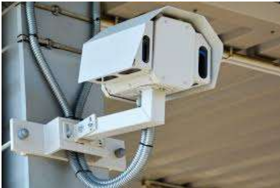
Figure 4: Motion Sensor