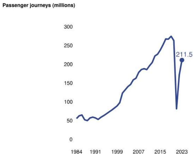
Figure 1: Light rail and tram passenger journeys (millions): England, annually from year ending March 1984 to year ending March 2023 (UK Department for Transport., 2023)

Also, the report shows that light rail and tram passenger revenue increased by £329 million, representing a 30% rise from the year ending March 2022 to the year ending March 2023. This significant increase reflects the higher number of passengers during this period (UK Department for Transport, 2023).