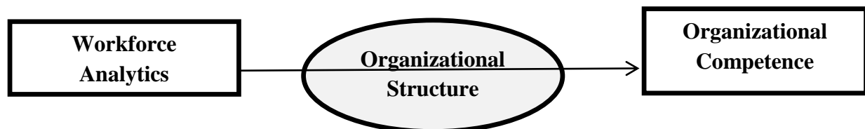
Fig.1.1 Conceptual model for workforce analytics and organizational competence

H 03 : Formalization does not significantly influence the relationship between workforce analytics and organizational competence of GSM telecommunication firms in Nigeria.