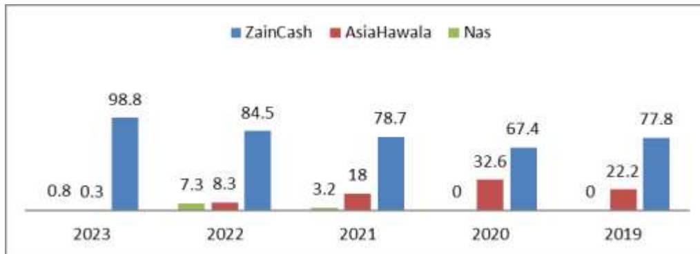
Figure 1 : Percentage Of Amounts Transferred From Digital Wallets In Iraq 2019-2023